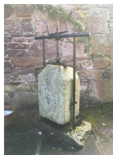
372. Granite cheese press