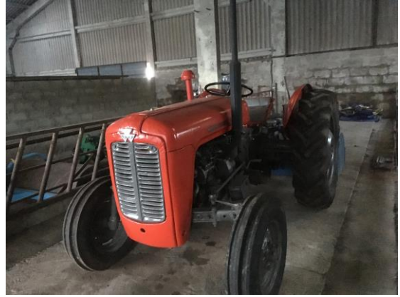
549. Massey Ferguson 35